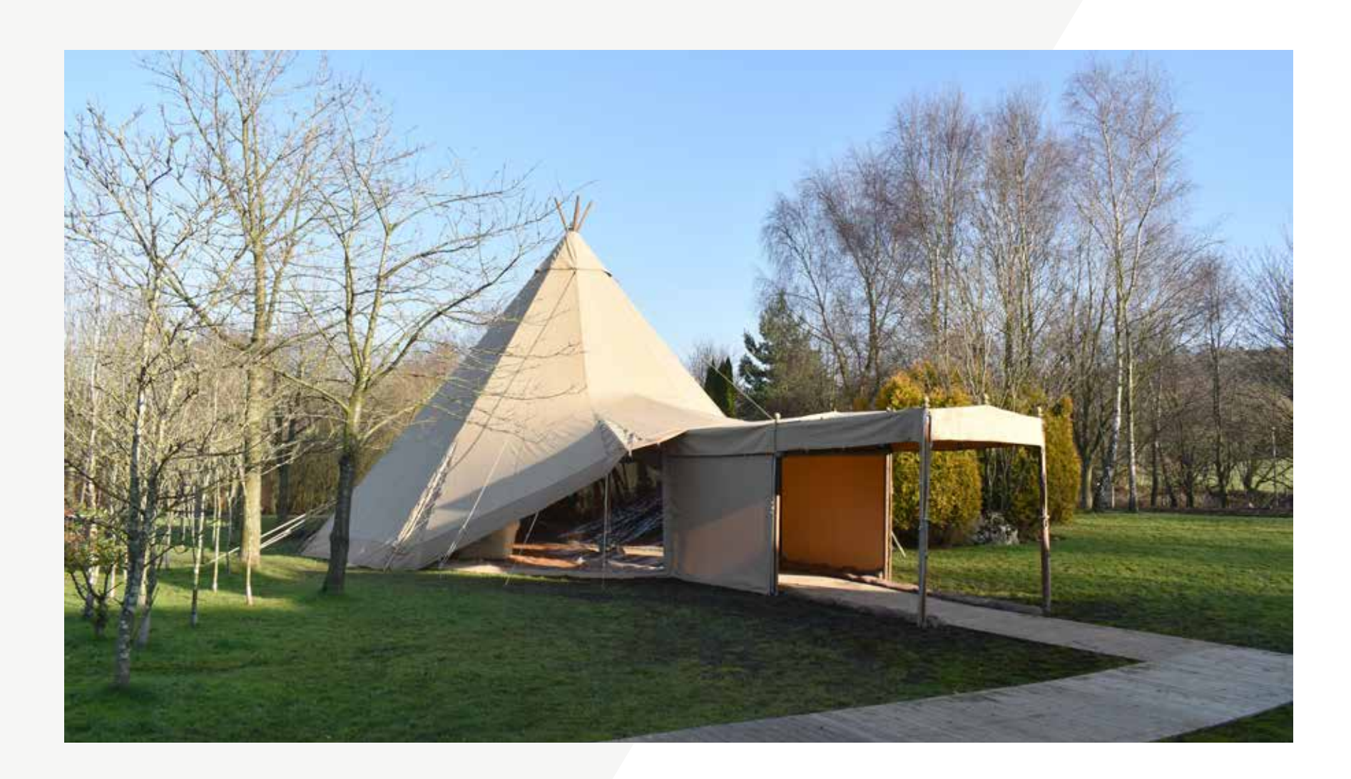
KIT 2 TWO BIG HATS