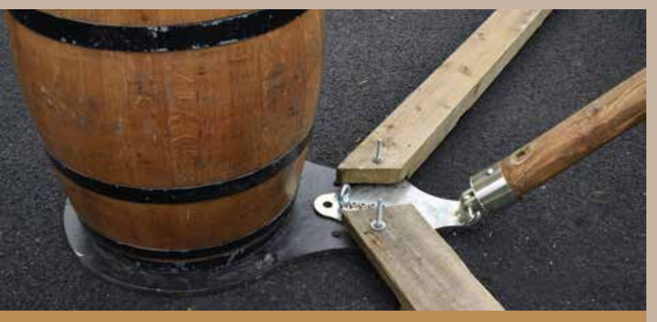
Anchorage Kit attached to Ballast Barrel Base Plate

PRICE £800 - for set of nine Ballast Base Plates