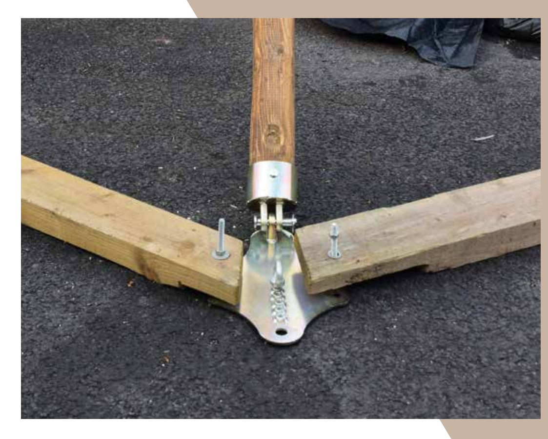
PRICE £895 - for set of nine steel base plates

PRICE £100 - for pack of 60 D-ring brackets (to secure the canvas to the timber ring beam)