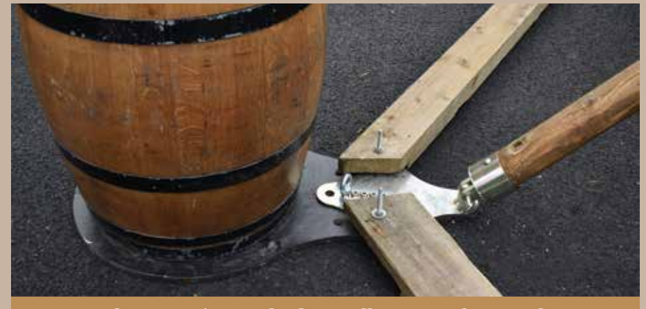
Anchorage Kit attached to Ballast Barrel Base Plate

PRICE £800 - for set of nine Ballast Base Plates