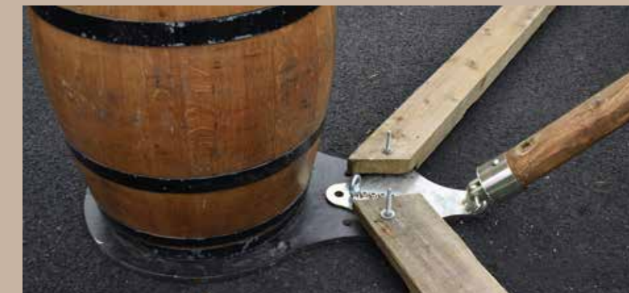
Anchorage Kit attached to Ballast Barrel Base Plate

Our All-Terrain Anchorage Kit consists of nine pole sockets which fit to the end of the main tipi poles. These then fix onto the steel base plates (one per leg) that you use to secure the tipi to the ground.