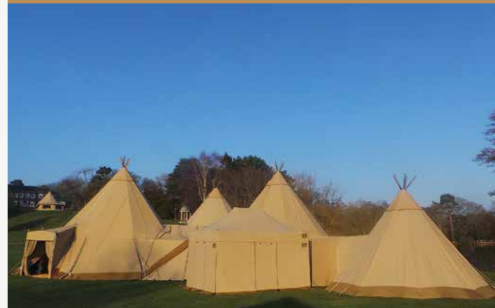
4.5 x 6m Catering Tent (Pop Up Catering Tent Package)

We offer two options of catering tent which are both covered in the same coloured canvas as the tipis to ensure they blend into the formation seamlessly.