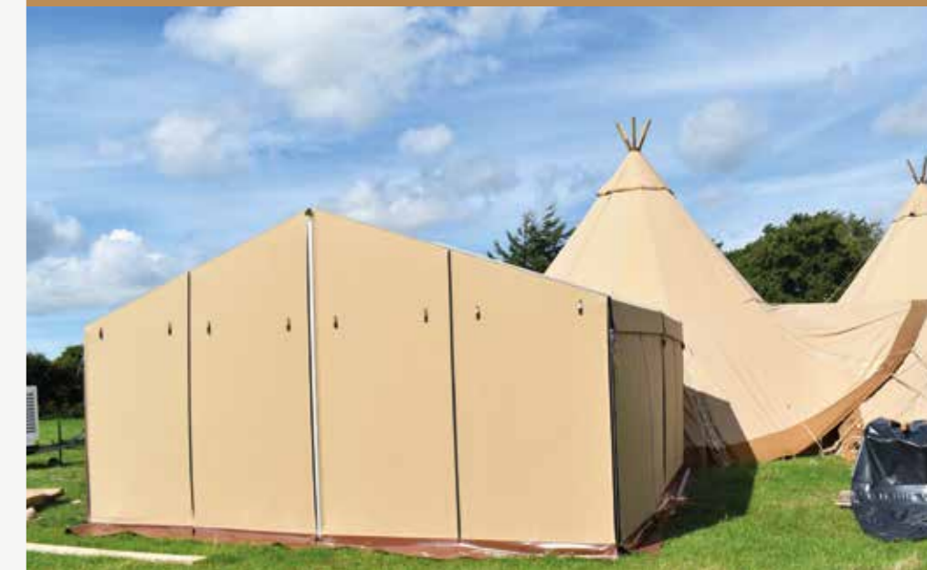
6 x 6m Catering Tent

The second option is an extremely sturdy box section aluminium catering marquee, covered in the same durable fabric as the tipis, ideal for long term installs during the winter period.